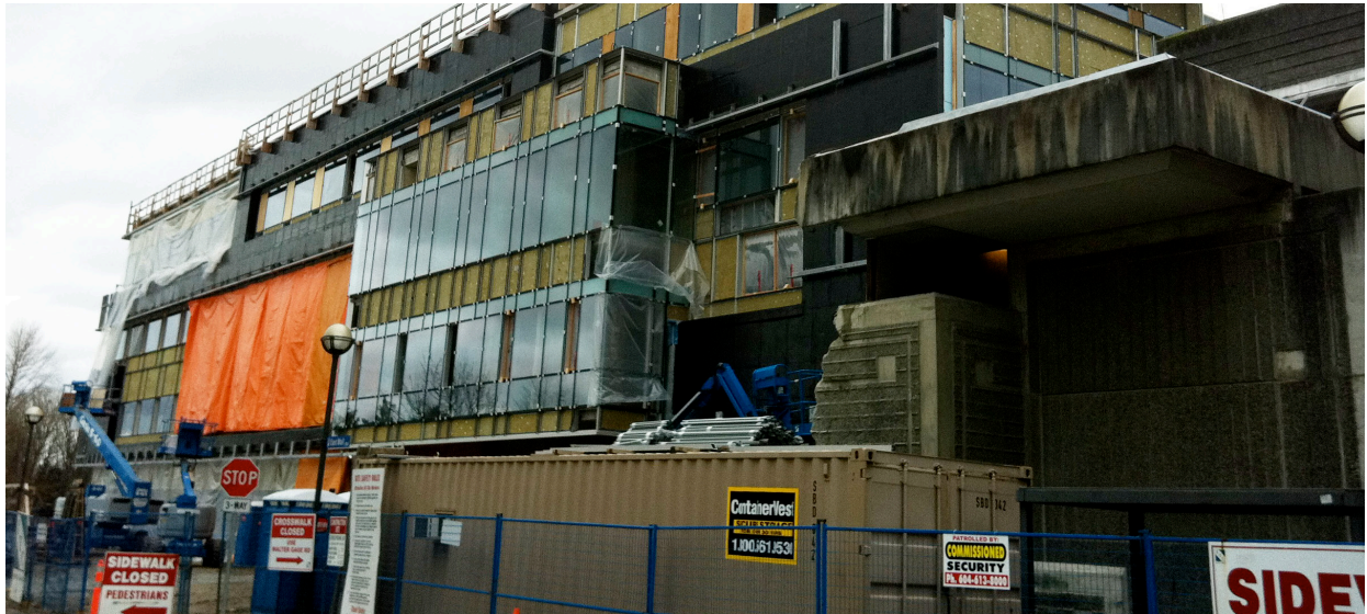
Pictured: The new UBC Law School under construction.